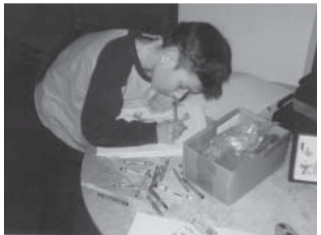
creating art . . . seeing progress

Children are seeing first-hand how buildings are constructed. They are learning about the work done by the many construction workers and craftspeople whose job it is to grade the site, truck in and assemble the rehabbed modular units that form the foundation, build, plumb, wire, paint, furnish and landscape our new school and clinic.